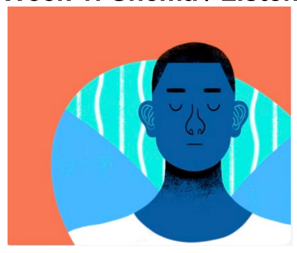
Week 1: Shema / Listen

Hear, O Israel: The LORD is our God, the LORD is one. And as for you, you shall love the LORD your God with all your heart, and with all your soul, and with all your strength. Deuteronomy 6:4-5